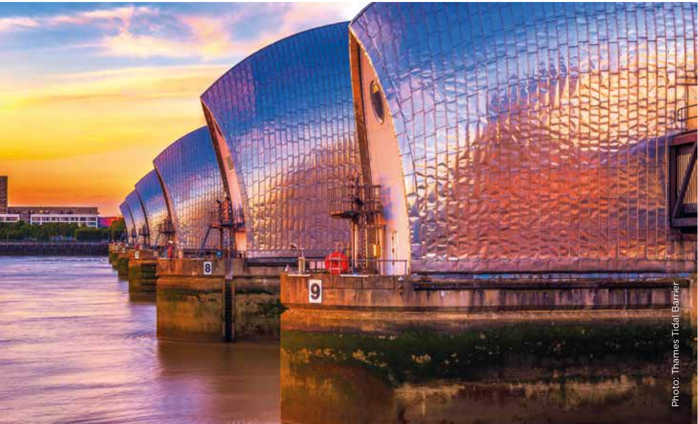
Photo: Thames Tidal Barrier

The core members have committed to a multi-year approach to prevention, with a mix of targets focused upon reducing harm and improving environment and behaviours. They work with other partners on a project-by-project basis, and alongside other safety groups in the capital. These include the broader focused Thames safety group and the London Home & Water Safety Council (LHWSC).